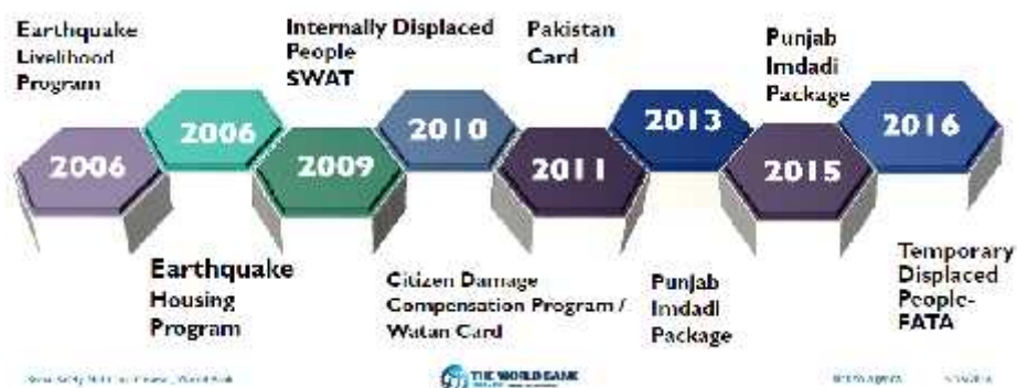
Figure 3 Chronology of cash-based responses to emergencies

Source: World Bank (2012) (PPT flood response)